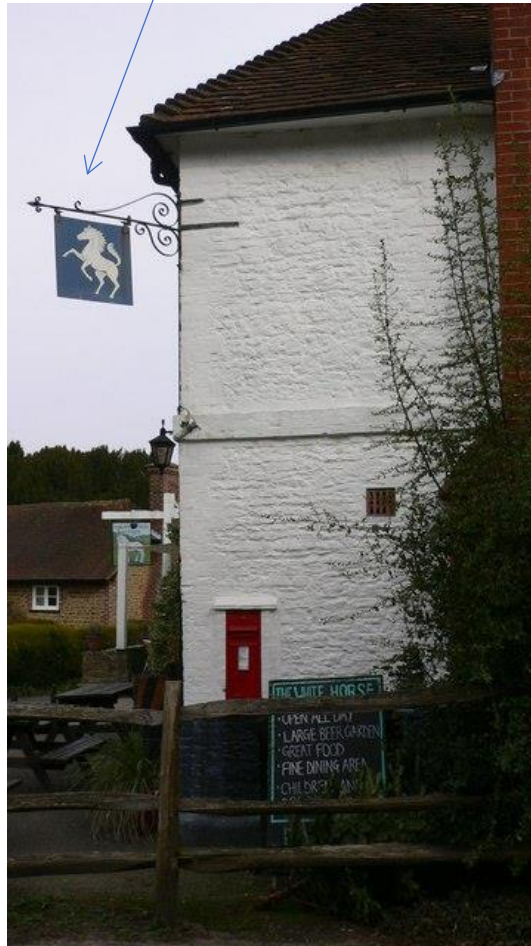
The corner pub sign originally designed by Gertrude Jekyll (famous craftswoman, gardener and artist) in 1926 and the repainted sign currently over the mantelpiece in what was the Public Bar.

We are disappointed there has been no recognition of the heritage of this deeply rural country public house whose history stretches back centuries just to be swept away with a corporate makeover, the one thing completely against the Young & Co Brewery plc's own Mission Statement.